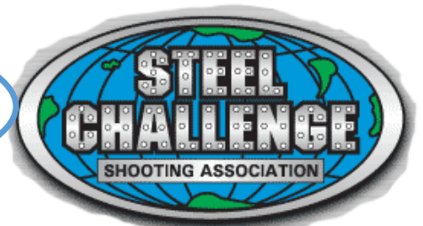
CTAGA .22 Steel Challenge