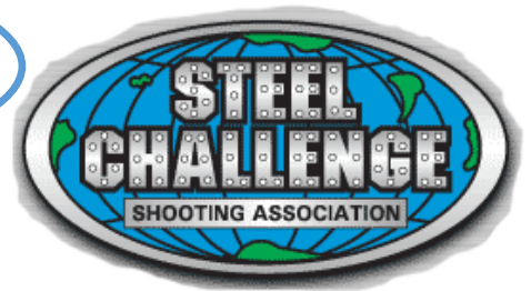
CTAGA .22 Steel Challenge